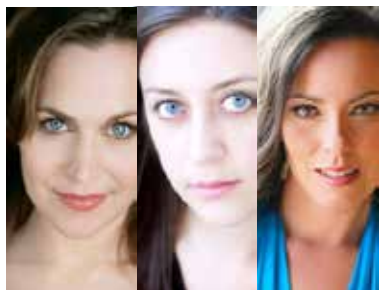
3 DIVAS CABARET