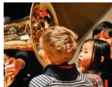
FAMILY CONCERT INSIDE THE ORCHESTRA