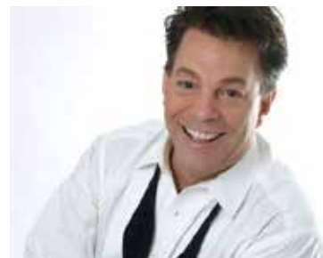
SIMPLY SINATRA WITH FESTIVAL ORCHESTRA