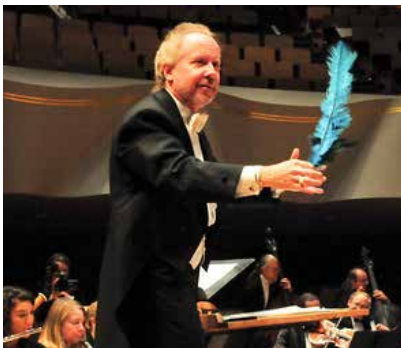
INSIDE THE ORCHESTRA