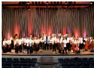
FESTIVAL GRAND OPENING