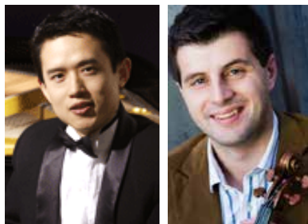
RACHMANINOFF'S THIRD PIANO CONCERTO & CLOSING NIGHT DOUBLE CONCERTO