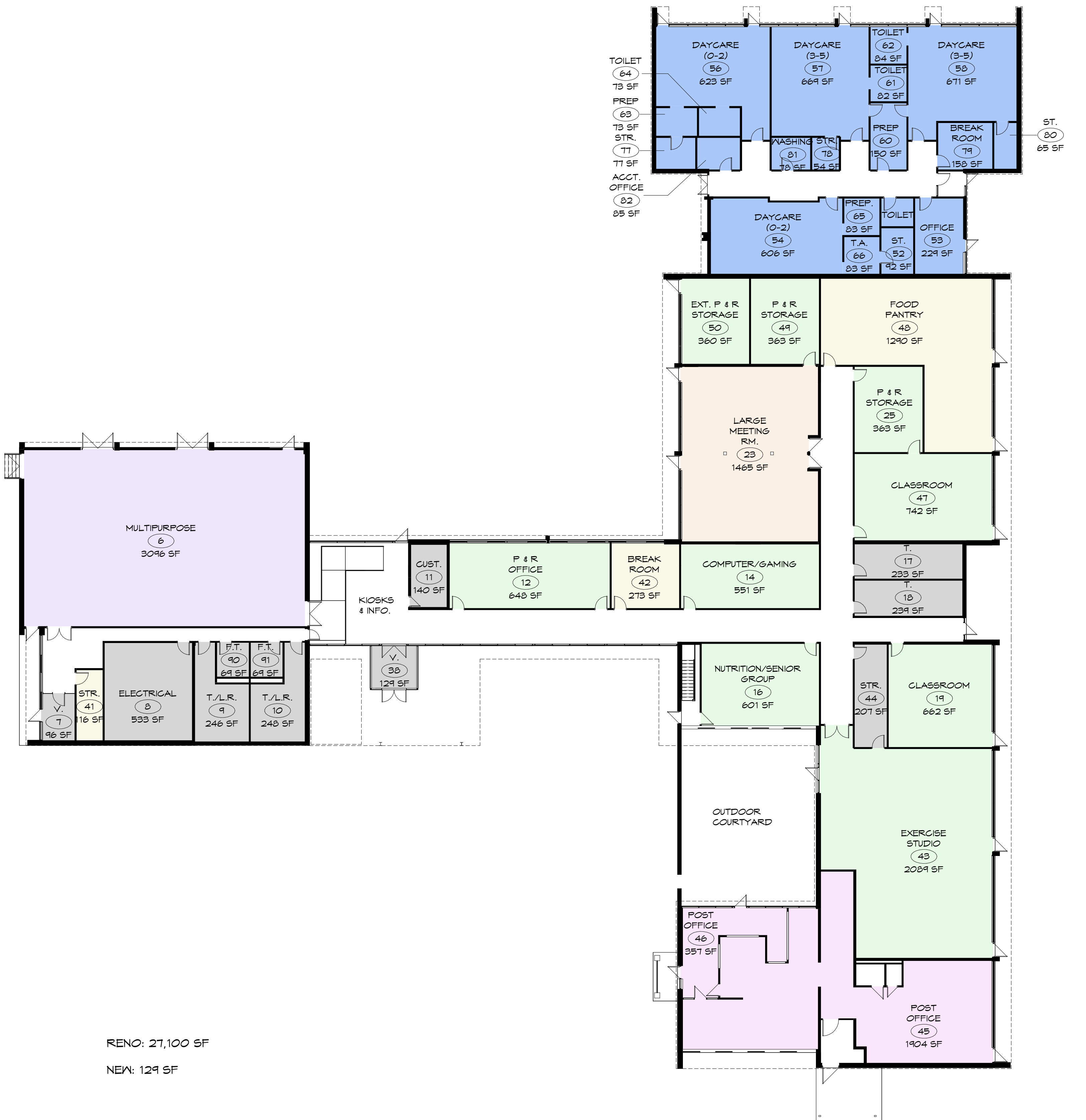
OPTION I: COMMUNITY CENTER FLOOR PLAN