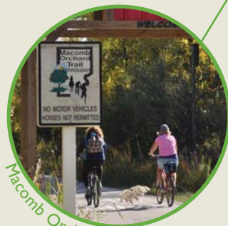
Macomb Orchard Trail