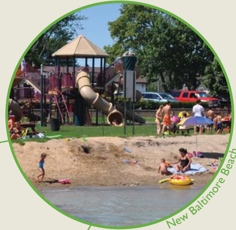
New Baltimore Beach