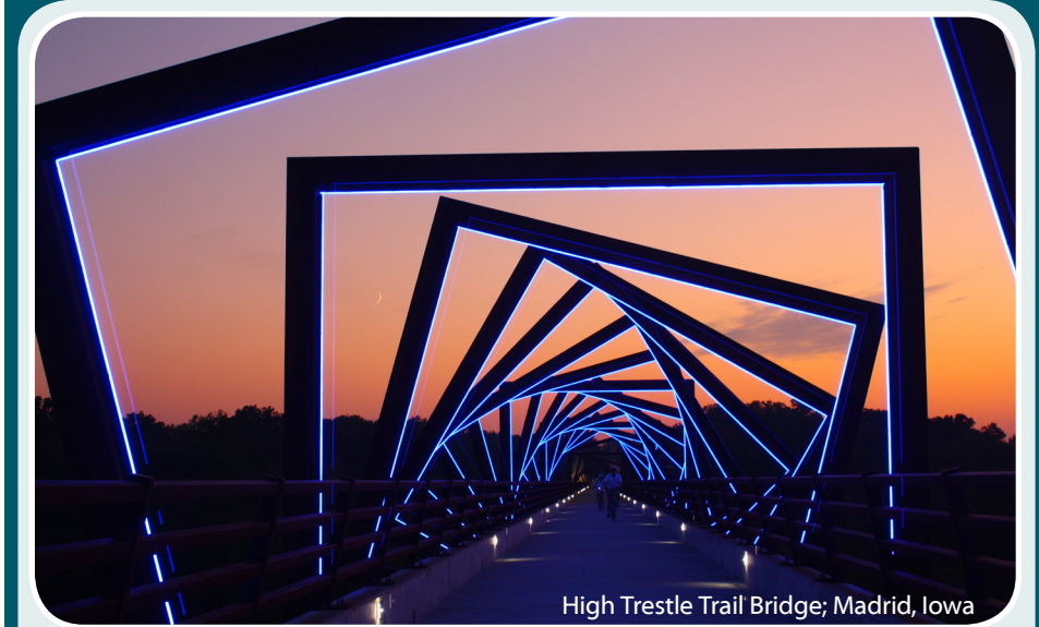
High Trestle Trail Bridge; Madrid, Iowa

The trail system in the Bloomington Region is one of the core amenities and drivers of tourism. The City of Bloomington has a public art program along the B-Line trail. This concept should be built upon and expanded into the Urbanizing Area. Any new trails should be constructed with some public art strategically placed along each corridor to enrich the user experience.