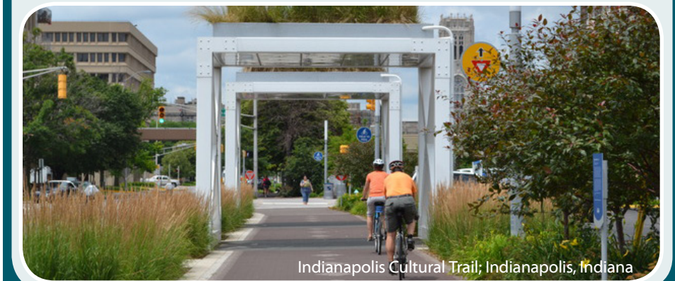
Indianapolis Cultural Trail; Indianapolis, Indiana

Examples of public art along trails include sculptural bridges, unique lighting, custom pavement, murals on adjacent buildings, and integrated sculpture. Also, this opportunity for public art would be a tremendous boon for the local arts community and would support both established and emerging artists.